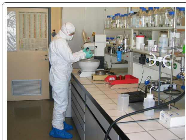
Figure 7 Illustration of personal protective equipment for work with nano. Illustration of personal equipment to be used in a Nano 3 laboratory.

Present knowledge on nanomaterial toxicity is insufficient for completing precise risk assessment. Threshold Limit Values for nanomaterials do not exist nor is there standard equipment for sufficiently detailed routine exposure measurements. However, since preliminary scientific evaluations show that there are reasonable grounds for concern that activity with nanomaterials might have damaging effects on human health; the precautionary principle must be applied. Here we propose practical, clear and simple procedure for Nano safety and health management, which is a general approach based on the state of the nanomaterial in question (fibers and particles as powder, suspension, or in a solid matrix). New hazard knowledge will be used as it is developed and made available. The procedure proposes